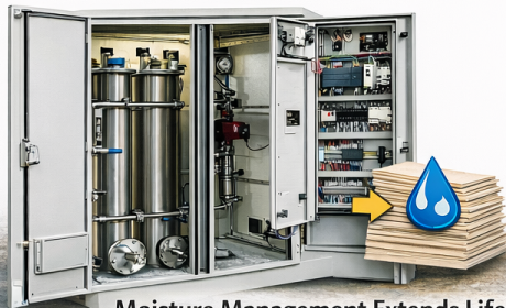
Moisture Management Extends Life